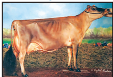
Page-Crest Excitation Karlie

Supreme Champion 2013 RAWF, Grand Champion 2013 Royal Ag Winter Fair, World Dairy Expo & Eastern States Expo, Selling numerous daughters & granddaughters