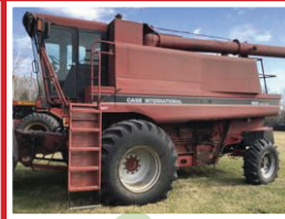
Later Model 1680 Case IH combine w/pickup head , 7046 hrs