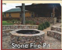
Stone Fire Pit