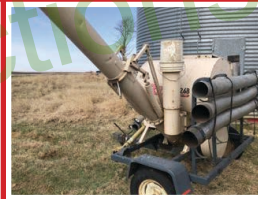
REM 1026B Grain Vac