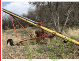
40' Westfield Auger w/ gas engine