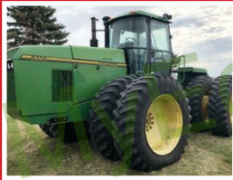
JD 8770 4WD Tractor , 3 hyd., 20.8 42 radial duals (30%), 3 hyd., 7935 hrs.

AUCTIONEER'S NOTE: Reuben spent a lifetime on the farm. This will be a large and interesting auction consisting of machinery, tools, antiques and household. Hope to see you there! INTERNET BIDDING: Live Internet bidding starts at 1:00 p.m.. For live bidding the day of the auction, go to www.proxibid.com . Pre-registration is required prior to auction day. Lunch will be served!