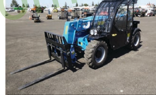
2018 Genie GTH-2506 4x4 Telescopic Handler