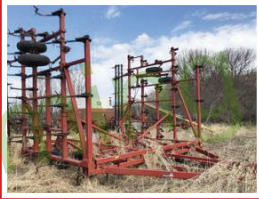
44' Case IH Field Cultivator w/ harrows