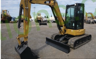
2017 Caterpillar 305E2CR Excavator