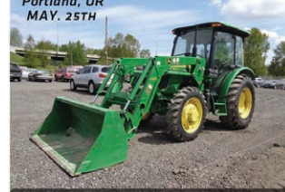
2016 John Deere 5065E 4x4 Tractor