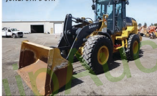
2016 John Deere 544K II Wheel Loader