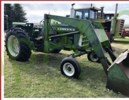
1800 Oliver Loader Tractor, gas, tires (good), factory 3 pt., 6094 hrs.