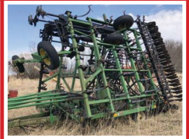
JD 787 Air Seeder w/ 730 seeding tools , rubber press wheels