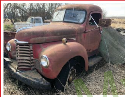
1947-1949 International KB-5 Truck