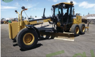
2007 John Deere 870D Motor Grader