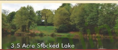
3.5 Acre Stocked Lake

FOR MORE INFORMATION & UPCOMING AUCTIONS Visit www.demottauction.com