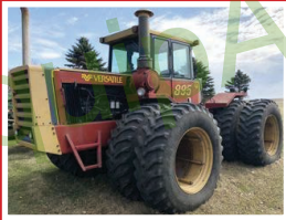
895 Versatile 4WD Tractor , 20.8 38 radial duals (40%), 4 hyd., 9636 hrs.