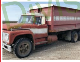
1968 Ford 800 Tandem Axle Grain Truck w/ box & hoist