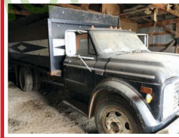
Early 70's GMC Grain Truck, single axle w/ box & hoist