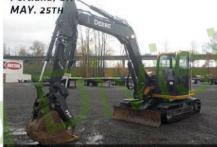
2016 John Deere 85G Hydraulic Excavator