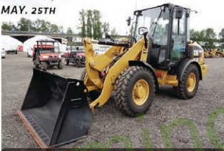
2018 Caterpillar 906M Wheel Loader