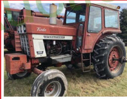
IH 1066 2WD Tractor w/ cab , suitcase weights, 18.4 38's (90)