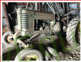
Antique JD Wide Front Tractor, shedded