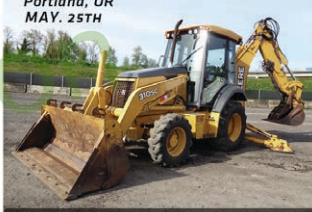
2006 John Deere 3105G 4x4 Backhoe